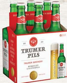
Trumer Pilsner 6-Pack