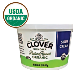
Clover Sonoma Organic Sour Cream 16 oz.