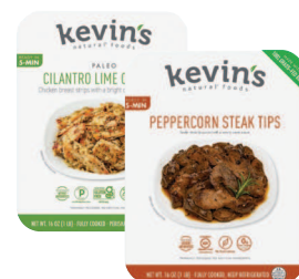
Kevin's Natural Foods Paleo Fully Cooked Entrées