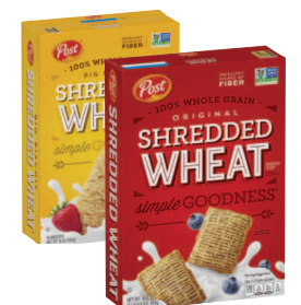
Post Shredded Wheat Cereal