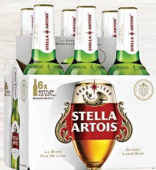
Stella Artois 6-Pack