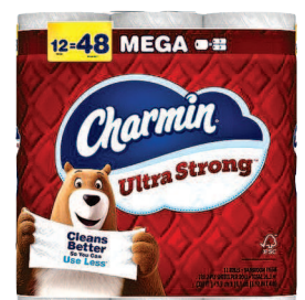
Charmin Ultra Strong Bathroom Tissue 12 Rolls