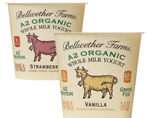
Bellwether A2 Organic Whole Milk Yogurt Selected Varieties, 5-6 oz. Save $0.98