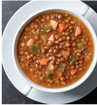
Green Lentil Chili Save $1.00lb.

Made with warming spices, this chili is filling, flavorful, and perfect for a wholesome comfort meal.