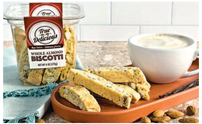
True Delicious Biscotti

These artisan biscotti are baked for a satisfying crunch and rich flavor. Perfect for dipping into coffee, tea, or dessert wine. Select Varieties, 6 oz.