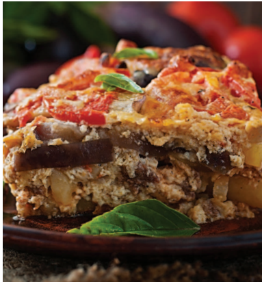
Beef Moussaka Save $1.00lb.

This traditional beef moussaka features layers of savory, seasoned beef and comforting flavors.