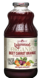
Lakewood Organic Beet Carrot Orange Juice 32 oz. Save $1.00