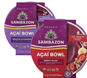
Sambazon Acai Bowl Selected Varieties, 5-7 oz. Save $1.50