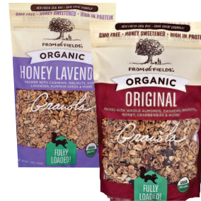
From The Fields Organic Granola Selected Varieties, 12 oz. Save $1.50