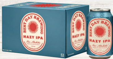
Best Day Brewing Non-Alcoholic Beer Selected Varieties, 6-Pack Cans Save $2.00