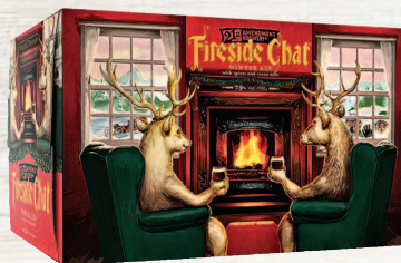
21st Amendment Fireside Chat Winter Ale 6-Pack Cans