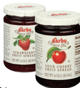
D'Arbo Fruit Spread Selected Varieties, 16 oz. Save $1.00