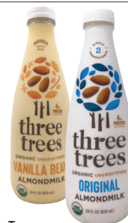
Three Trees Milk Alternative Selected Varieties, 28 oz. Save $1.60