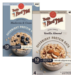
Bob's Red Mill Overnight Protein Oats Selected Varieties, 4 count. Save $0.50