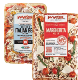
Massa Pizza Co. Frozen Pizza Selected Varieties, 20-25 oz. Save $3.00