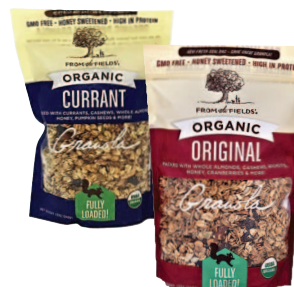
From the Fields Organic Granola Selected Varieties, 12 oz. Save $1.50