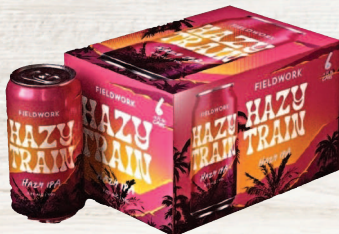
Fieldwork Hazy Train Hazy IPA 6-pack Save $2.00