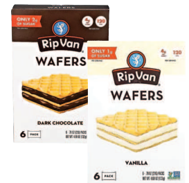
Rip Van Wafers Select Varieties, 6 count Save $1.30