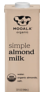
Mooala Organic Simple Almond Milk 32 oz Save $1.00