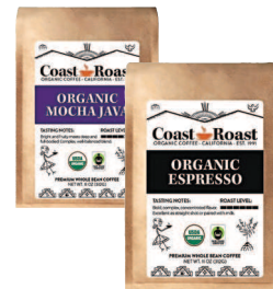
Coast Roast Organic Whole Bean Coffee Selected Varieties, 11 oz. Save $2.00